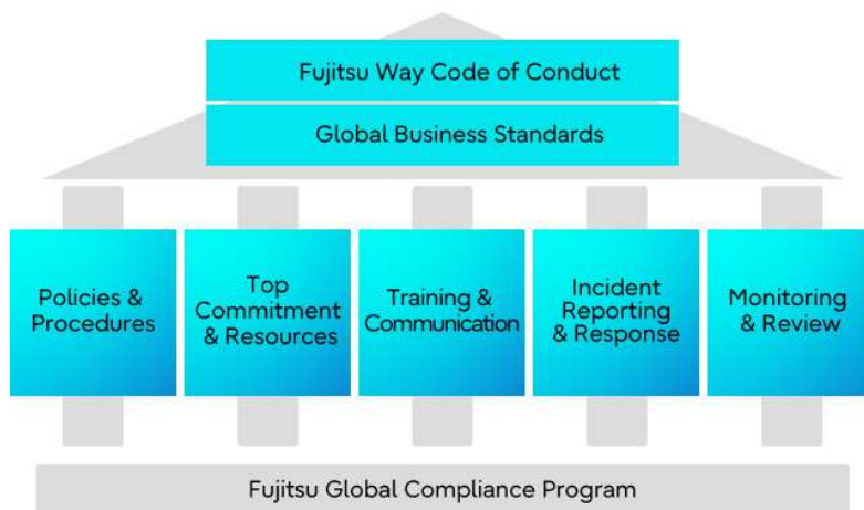
Global Compliance Program

When implementing the GCP, we establish internal Group rules and assign a compliance officer in each region to be responsible for compliance activities and ensure the structure's implementation. We also continuously provide employees with various forms of training, with the goal of embedding the Fujitsu Way Code of Conduct and the GBS. In addition, we have established an internal whistleblower system in the event of compliance issues, and employees are required to immediately report compliance violations to the Risk Management & Compliance Division if they are discovered. We periodically verify the effectiveness of the GCP through measures such as risk assessment, audit, and reviews by external specialists, and continuously work towards improving the GCP.