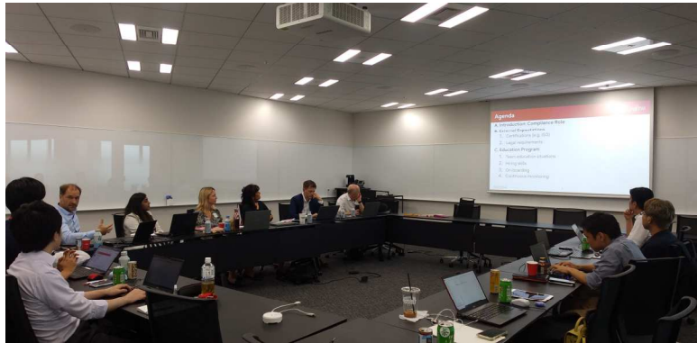
Compliance officers' meeting